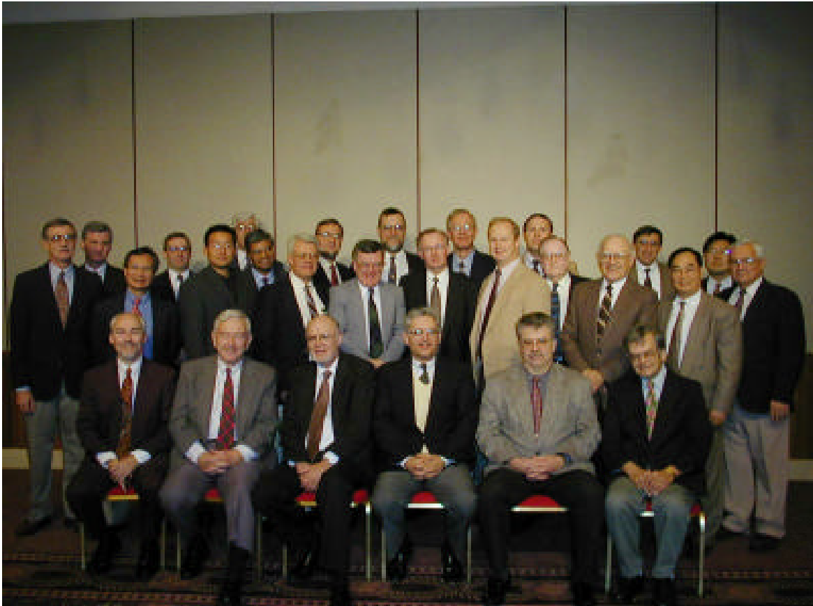
The 25th Annual Meeting of NAPARC - Los Angeles, November 2000