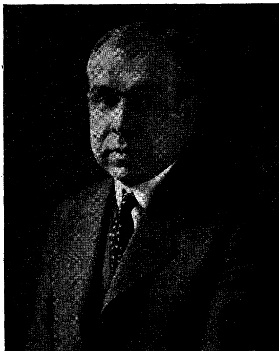
Dr. J. Gresham Machen

In comparison with the insight into the depths of