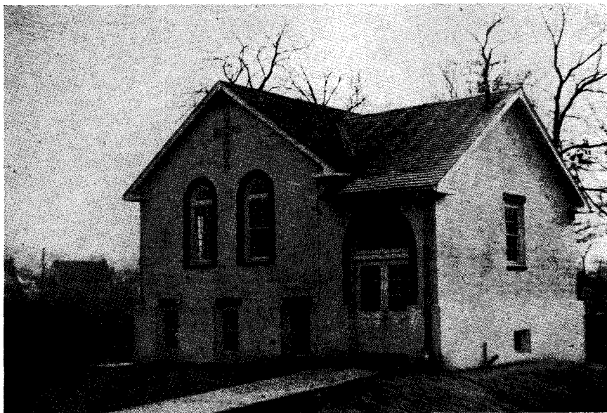
Crescent Park Chapel

Months of delay followed. This delay was caused partly by the reluctance of the bonding company to make any sort of settlement until they were certain that the contractor could not be forced to complete the building, and partly by the difficulty we had of locating another contractor who would be willing to give us a bid on completing the building. Finally, however, a contractor who would finish the building was located. It turned out that the amount of money which he wanted for the completion of the building, which was now about half finished, would result in a loss to us of about $5,500. This amount was given to us by the bonding company. I think one lesson which all of us connected with this situation learned was that if there is any doubt whatsoever concerning the trust-