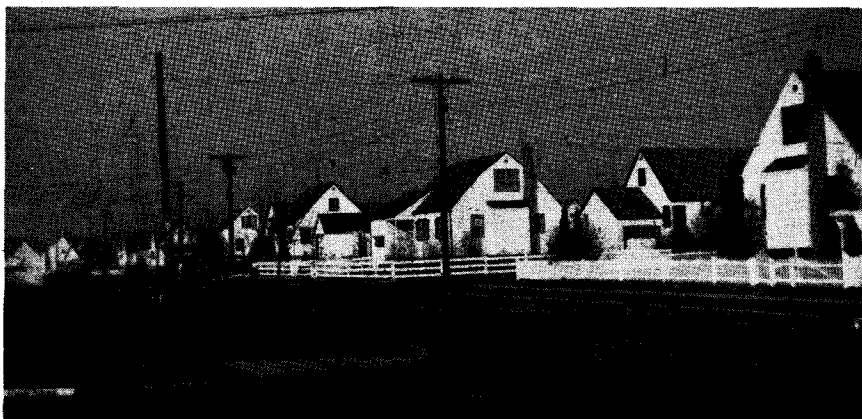
View of Community taken from Crescent Park Chapel

This Fellowship appears designed to take over some of the work of the Continuing Committee which officially ceased its activities last spring.