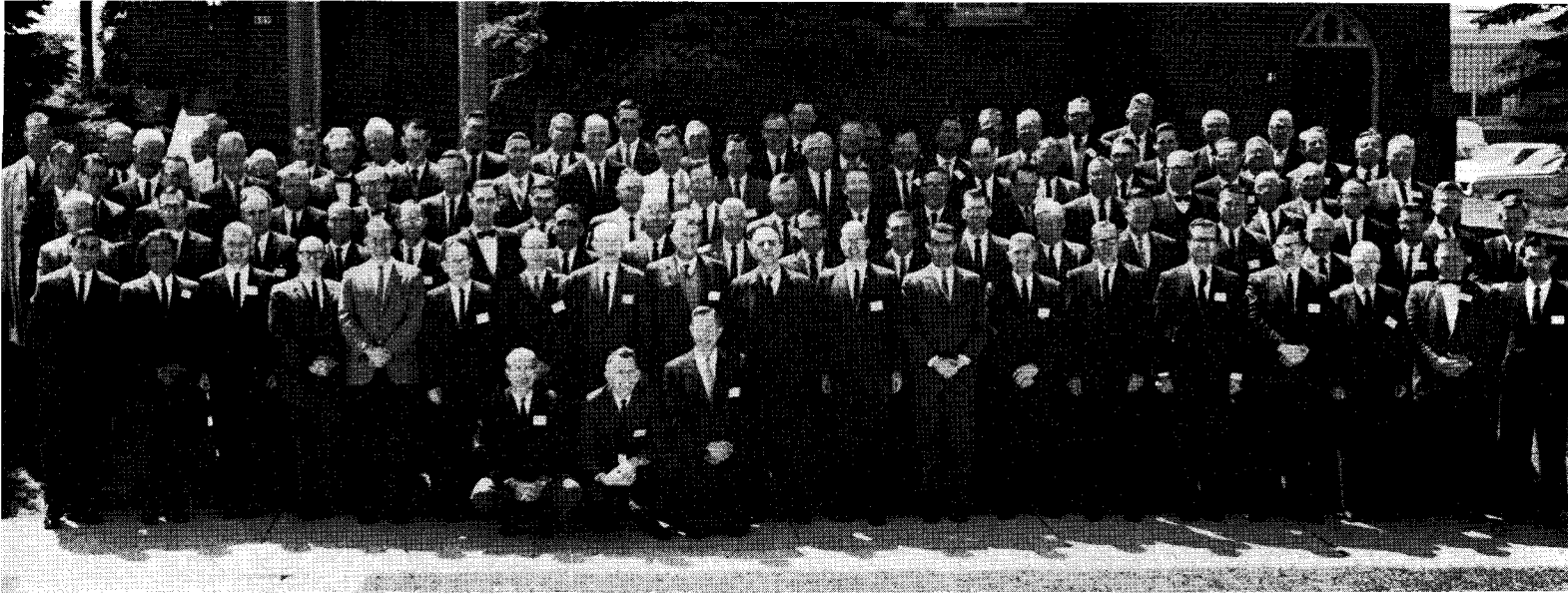
COMMISSIONERS AT THE THIRTY-THIRD GENERAL ASSEMBLY OF THE ORTHODOX PRESBYTERIAN CHURCH HELD AT BETHEL CHURCH, OOSTBURG, WISCONSIN.

on the topics discussed or conclusions reached.