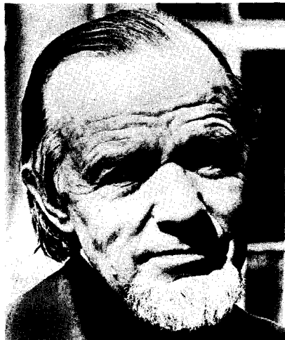
Dr. Francis Schaeffer was featured speaker at a public session of the Assembly, meeting in Macon, Ga.

"Under the New Testament, our Lord at first collected His people out of different nations, and united them to the household of faith by the ministry of extraordinary officers who received extraordinary gifts of the Spirit and who were agents by whom God completed His revelations to His