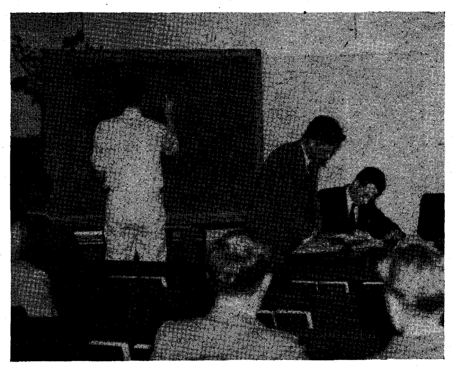
POSTING THE RESULTS of a ballot to elect the Class of 1946 of the Committee on Foreign Missions.

A debate then ensued which, for a time, threatened to become similar to that occasioned by the Peruvian matter in the report of the Committee on Foreign Missions. It was intro-