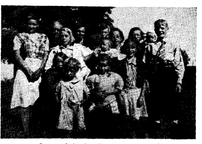
Some of the Dwellers on South Hill

Since war restrictions prevent us from printing extra copies, those who contemplate sending The Presbyterian Guardian as a Christmas gift, and who wish such gift subscriptions to start with the next issue, should send in their Christmas list immediately.