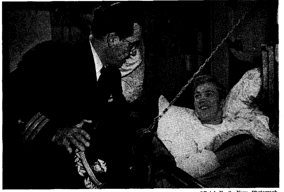
Visiting patients in the sick bay is one of the chaplain's duties.

that everyone will see, and many read. A regular column I call the "Chaplain's Chat" is nothing more nor less than a gospel tract incorporated into the news of the day, and many an editorial finds subtle, effective ways to present the claims of Christ and a call to true Christian living.