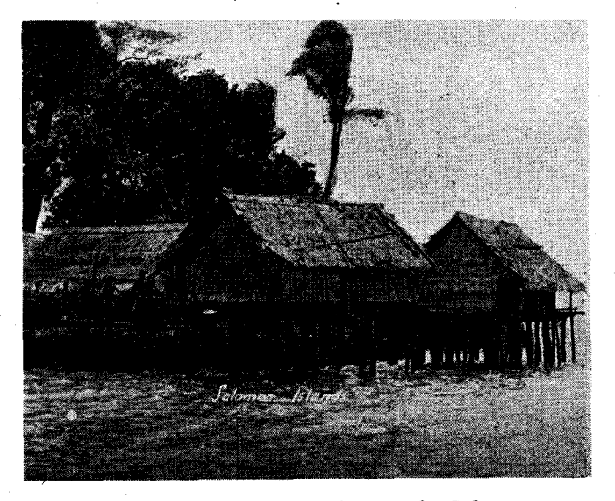
An off-shore view of native huts in the Solomons.

I mustn't forget the rains. Guadalcanal has a much lighter rainfall than the other islands in the Solomons—