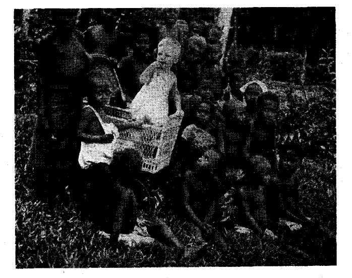
Native children with a white missionary's child.