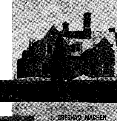
MEMORIAL HALL For Catalogue write,

Courses leading to the B.D., Th.M., and Th.D. degrees are offered.