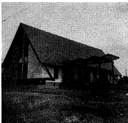
View of Calvary Church, Whittier