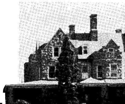
Machen Hall Westminister Seminary