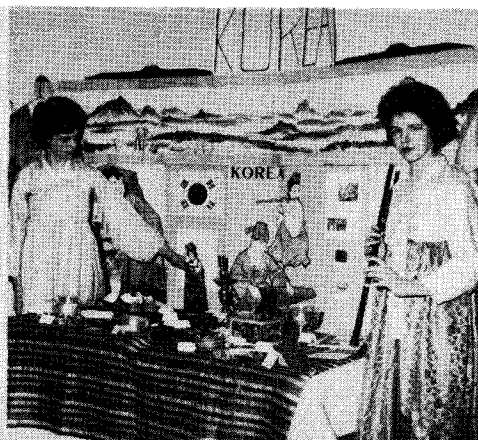
American girls in Korean dresses at the Korea display table.