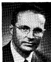
Westminster Seminary Librarian

The ground-breaking service for the new Library Building of Westminster Seminary was held on Monday afternoon, April 2. It was an occasion for profound thanksgiving that this long-sought step, a necessity to the Seminary, could at last be taken. It was also an occasion marked by faith that God will supply our financial needs, which are now brought to a crisis.