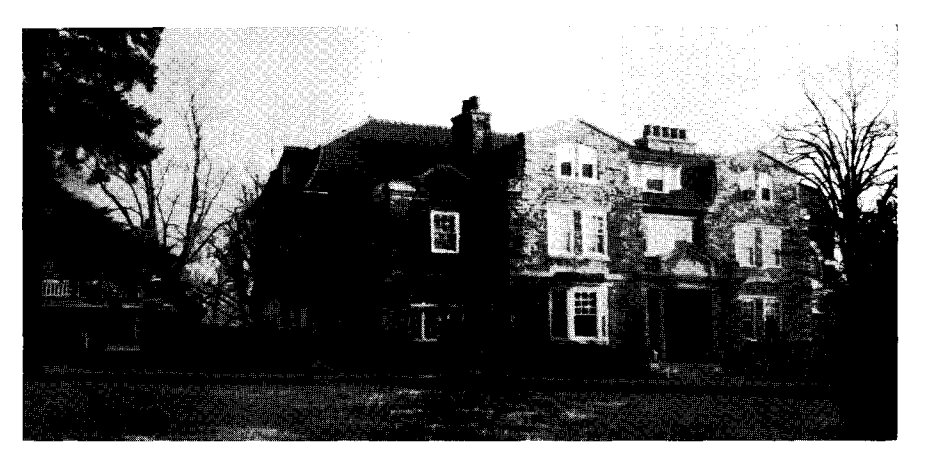
OPC Administration Building