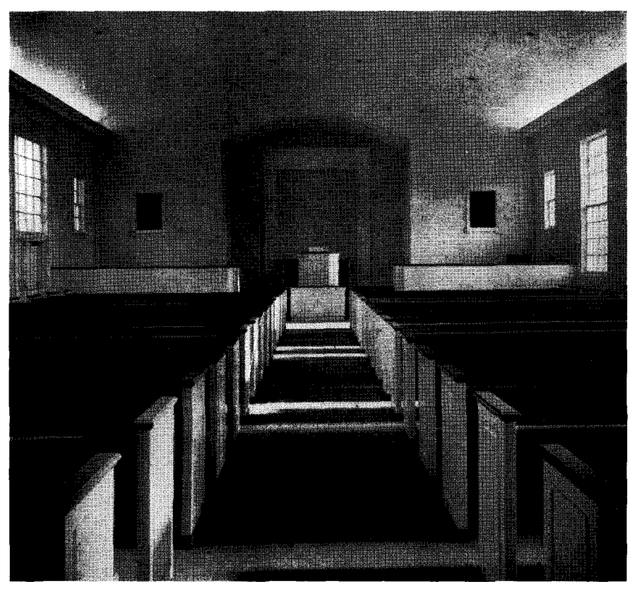
The Presbyterian Guardian

Calvary Church dedicated its 350-seat auditorium only last May.