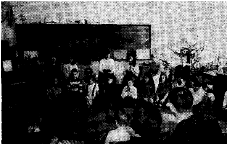
Christmas program at the American Sendai School.

Or C—Did Susan deserve to be sent to her room? Quite possibly, or at least to have some punishment administered. The thing that is wrong is that Susan has learned that mother is long on threats and short on action.