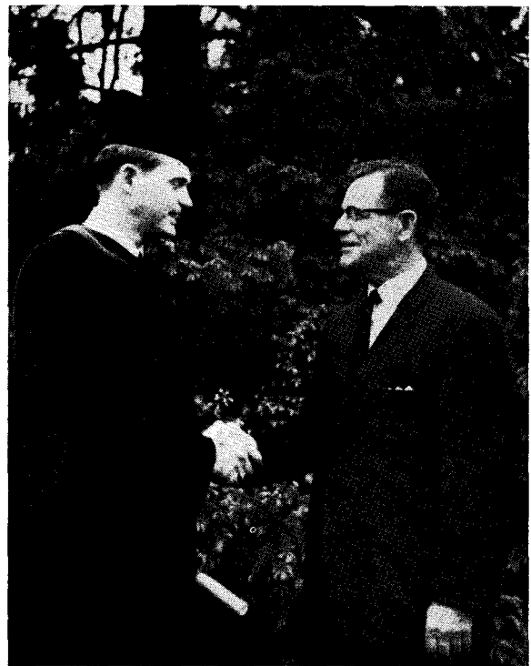
The Presbyterian Guardian