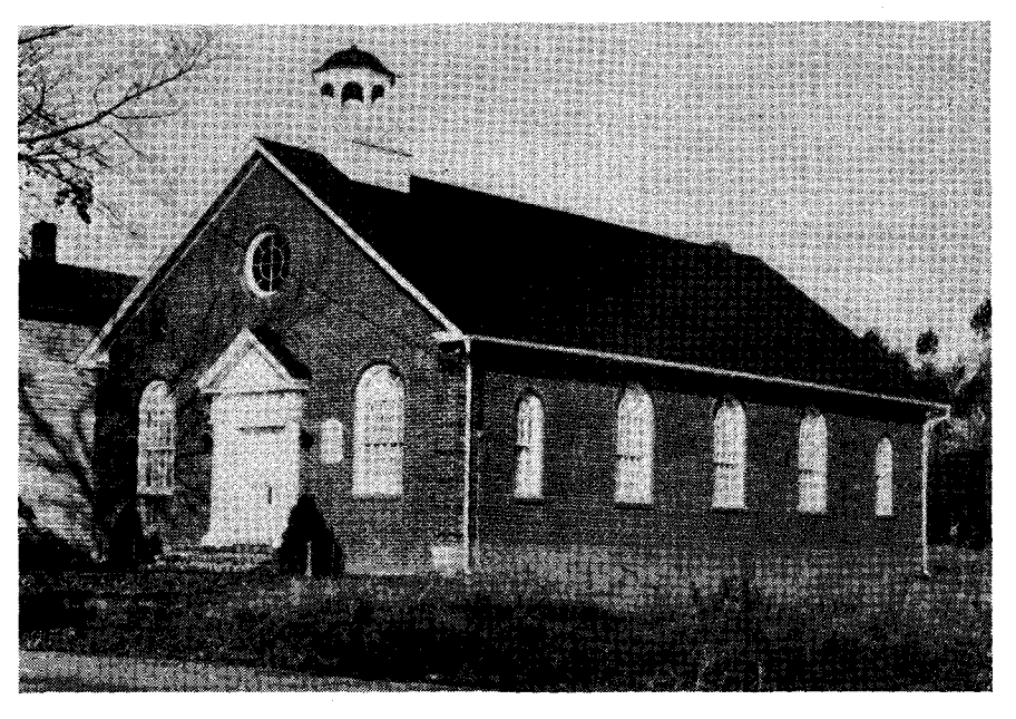
The New Building of Grace Church, Middletown, Delaware

addressed a fellowship meeting, bringing an encouraging message on the outlook of the denomination. . . . As a result of special effort expended during October, Sunday school attendance has been doubled. New lesson helps have been adopted and the