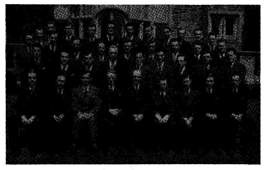
This Year's Student Body and Faculty at Westminster Seminary

Due to threatening skies and intermittent showers, the commencement exercises were held this year in the seminary auditorium instead of the outdoor amphitheatre. The Rev.