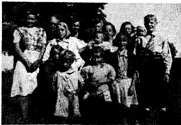
Some of the Dwellers on South Hill

Since war restrictions prevent us from printing extra copies, those who contemplate sending The Presbyterian Guardian as a Christmas gift, and who wish such gift subscriptions to start with the next issue, should send in their Christmas list immediately.