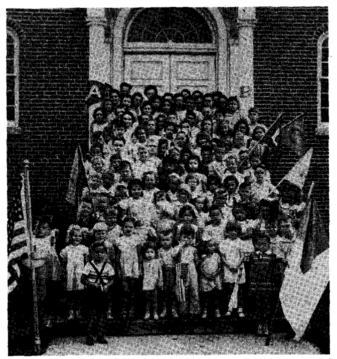
Children of the Troop School at Middletown, Pa.

The material published by the Orthodox Presbyterian Christian Education Committee was used for the school, with the addition of ideas received from the Troop School for Christian Soldiers manual published