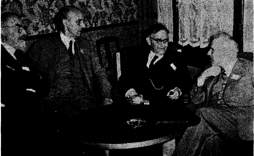
Religious News Service

America, a Catholic weekly published in New York, declared there is no doctrinal obstacle to Protestant-Catholic cooperation in reconstructing modern society, if the World Council report on the disorder in society represents Protestant thinking. The weekly did take exception to the manner in which capitalism and communism were condemned, holding that communism is by far the more serious obstacle. The editorial pointed to similarities between statements in the Protestant report and the language of numerous Papal encyclicals.