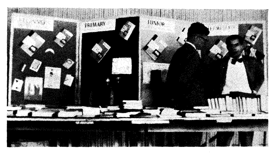
Display of Summer Bible School and other materials by Christian Education Committee at the General Assembly.

There are three phases to the Committee's activities—the Sunday school, the summer or vacation Bible school, and the publication of tracts. As to Sunday school material, the committee's work has been limited to publishing a teacher's manual to be used in connection with the Good News series of lessons put out by the Christian Reformed Church. These lessons (different from the Key-Instructor