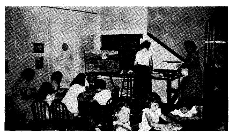
Another class at the West Collingswood school.