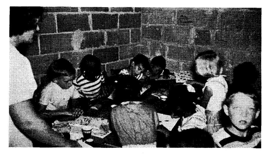
A corner of a basement room provides space for this interracial DVBS class at Calvary Church, Glenside, Pa.