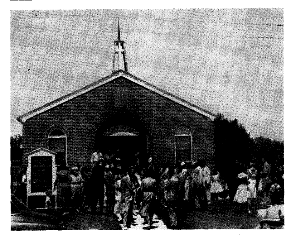
Park Hill Orthodox Presbyterian Church of Denver. Sunday morning worship for Assembly was held here, business sessions elsewhere.