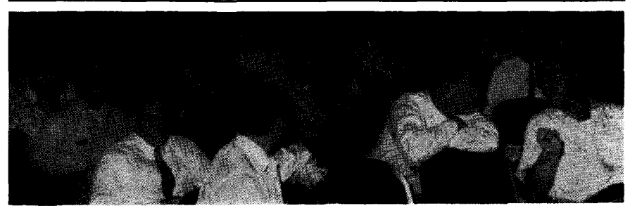
Heat and humidity made informal attire appropriate. Here delegates await report of tellers counting committee election ballot.

Publications and sales: Most of the publications, including vacation Bible school materials, tracts, books, and catechetical materials, are well known to our readers. It is of interest that the vacation Bible school materials were used this year by 115 churches outside the denomination, a substantial increase over the previous year. Also the sales of tracts published by the committee increased this year by (See "Assembly Report," p. 123)