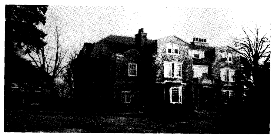
This will be the new headquarters for the Orthodox Presbyterian Church