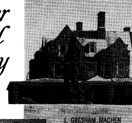
For Catalogue write, Director of Admissions WESTMINSTER THEOLOGICAL SEMINARY Chestnut Hill, Philadelphia 18, Pennsylvania

Courses leading to the B.D., Th.M., and Th.D. degrees are offered.