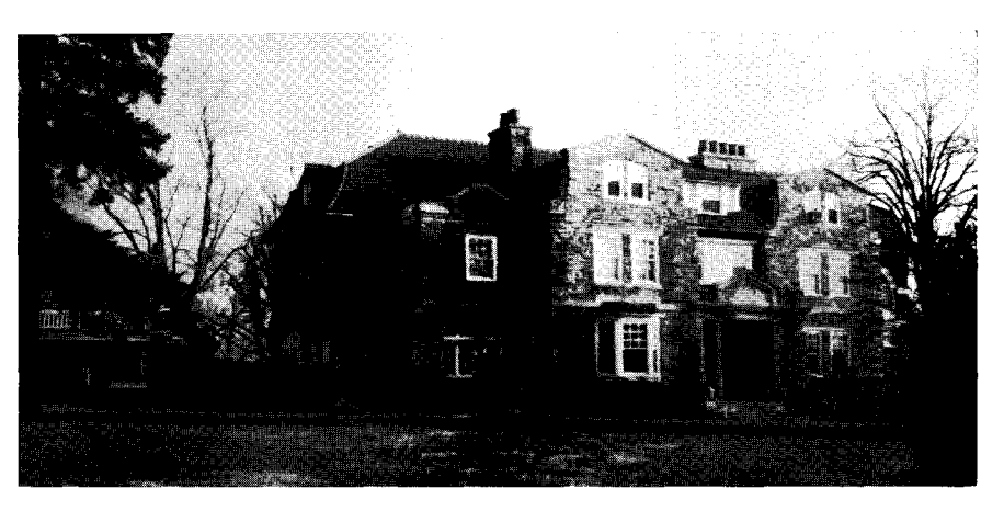
OPC Administration Building