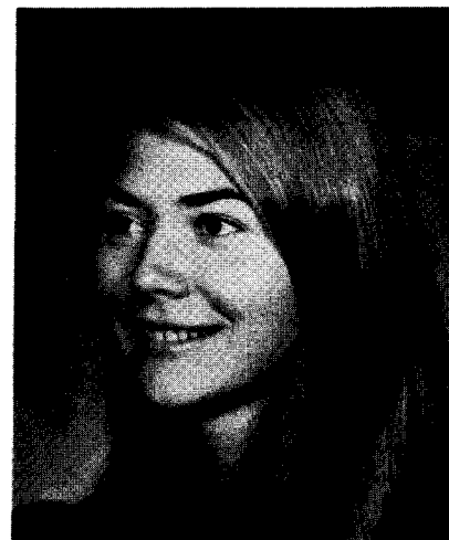
The Presbyterian Guardian