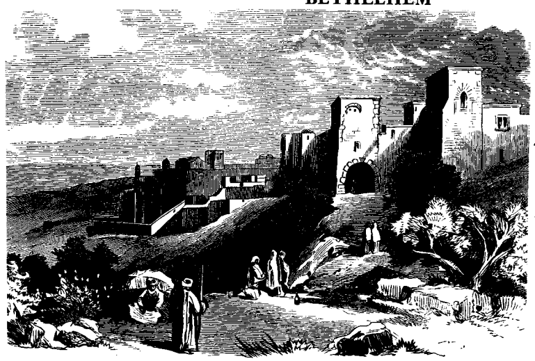
The Presbyterian Guardian